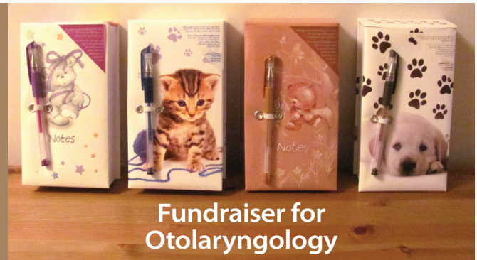
Fundraiser for Otolaryngology