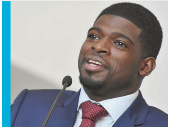
▼ P.K. Subban

On September 16, Montreal Canadiens defenceman P.K. Subban and his foundation, the P.K. Subban Foundation, pledged a minimum of $10 million to the Montreal Children's Hospital, the largest philanthropic commitment ever made by a professional athlete in Canada. As part of the agreement, Subban will also assist the Montreal Children's Hospital Foundation as a spokesperson for select Foundation fundraising campaigns and flagship events. In recognition of this extraordinary support, the Children's officially inaugurated the "P.K. Subban Atrium," the 486-square-meter, three-story public space located at the heart of the hospital's new facilities.