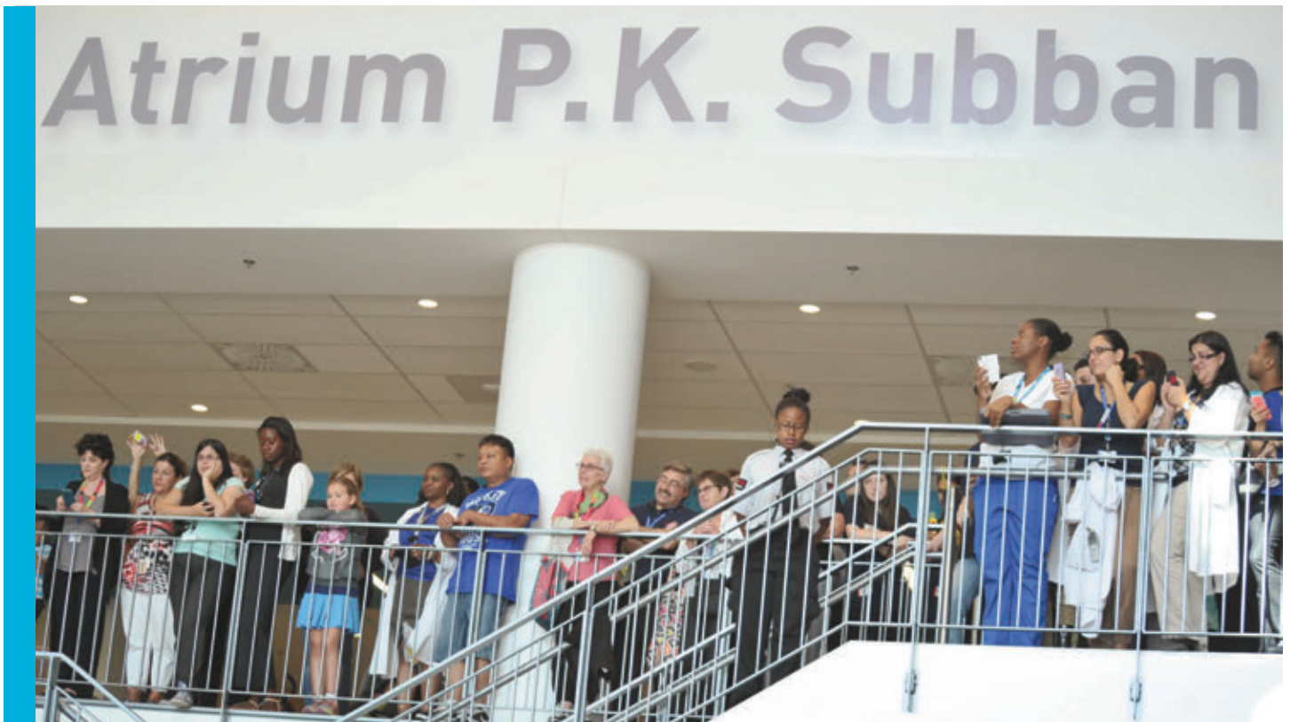
▼ P.K. Subban says he got "goosebumps" when walking into the atrium and seeing his name on the wall.