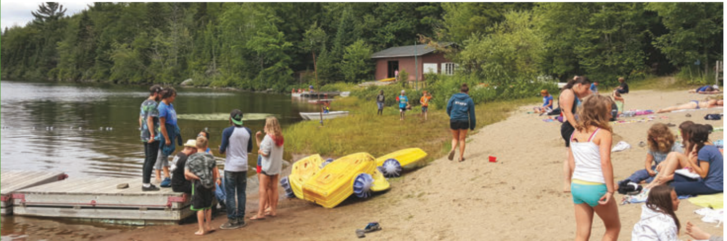
The campers enjoy waterfront activities on Lac Didi.